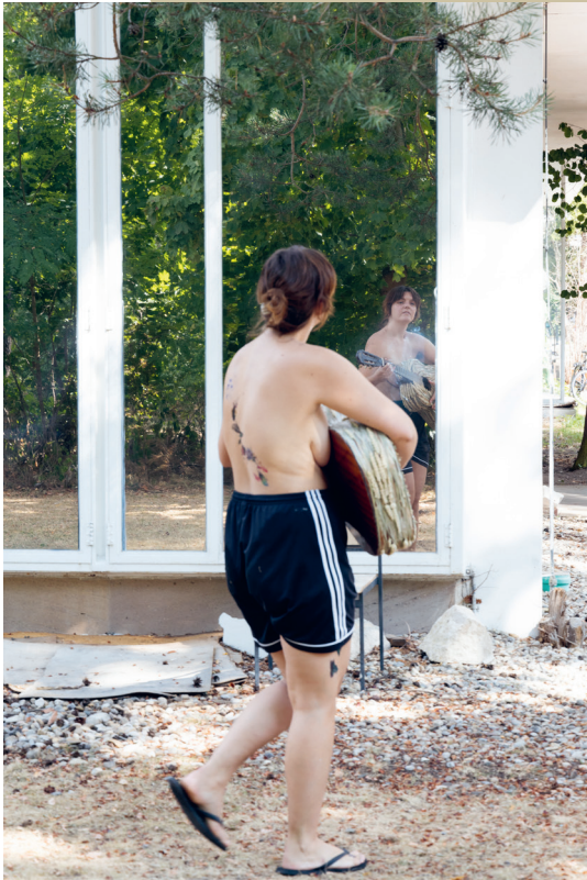
go further, 2022 Installation, Video, Performance Stroh, Projektor, Gitarre, Weizen, Mehl, Müll